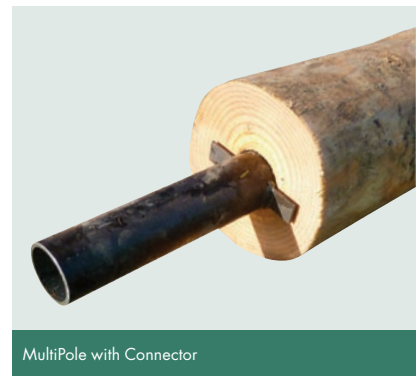
MultiPole with Connector