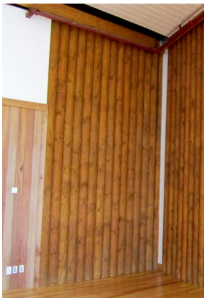
TTT UniLog MultiPoles used in a structural shear wall