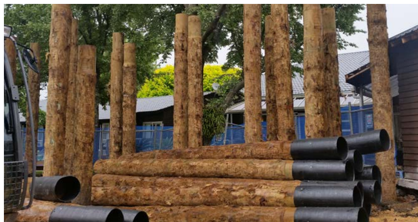
TTT Uglie MultiPoles joined during installation on a very tight site using polyethylene PE100 joiners