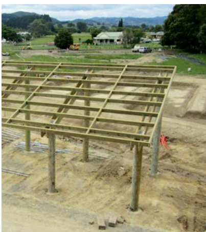
TTT UniLog MultiPoles used in the construction of a photovoltaic structure